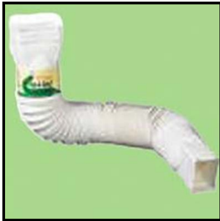
3 x 4 Elbow

A 4' black linking hose may be purchased for $10. Linking hoses connect rain barrels together for additional water storage capabilities. Flex elbows are also available which can direct water from the downspout into the rain barrel around corners to better conceal the rain barrels. Two sizes of flex elbows are offered. A 2" x 3" flex elbow is $8, and a 3" x 4" flex elbow is $12.