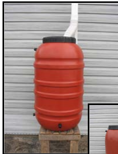
55 Gallon Terra-Cotta Rain Barrel