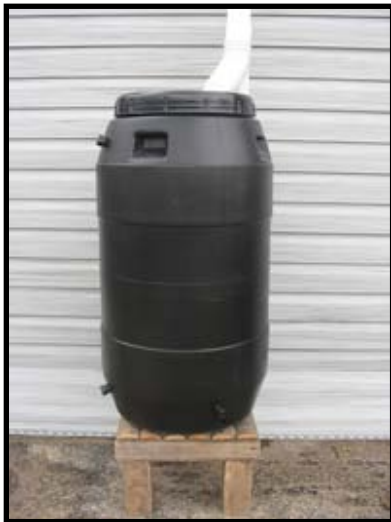
55 Gallon Black Rain Barrel

Rain barrels are come in black, grey, terra cotta, or brown. Rain barrels are available in either 50 or 55 gallons. Depending on the size, rain barrels are $65 or $70 each. Each rain barrel contains a perforated top with a mesh screen, top overflow valve, plastic spigot, and a bottom drain.