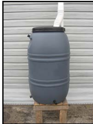
55 Gallon Grey Rain Barrel