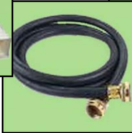
3 x 4 Elbow