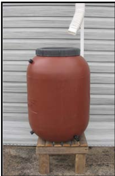
50 Gallon Brown Rain Barrel