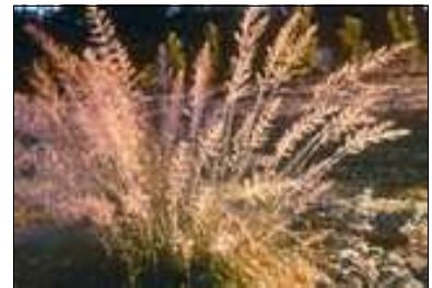
Prairie Drop Seed