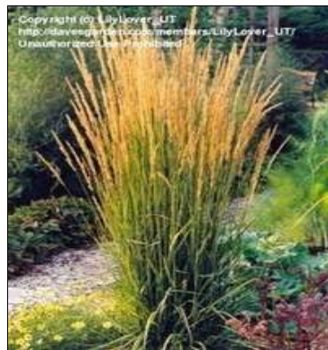
Feather Reed Grass