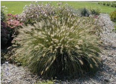
Hamelin Fountain Grass